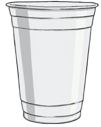
Two clear, plastic cups